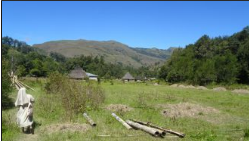
A Sister heads for a hamlet in Turiscaí

A local family offered their home where the sisters could teach the local children while the school and convent were being built on land donated by the community. The complex is now registered with the SPC sisters, who support the school directly.