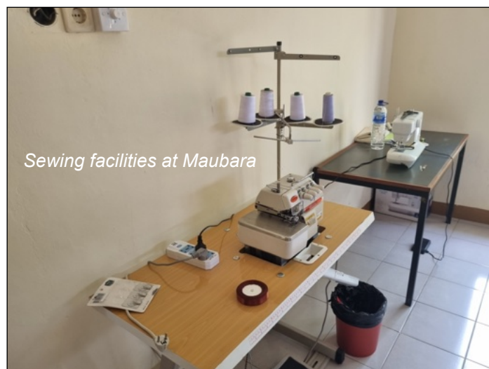
Sewing facilities at Maubara

Girls from St Therese's Orphanage, Maubara who are willing and able to continue their studies at the secondary level will continue to be assisted by ATLAS. In July 2021 ATLAS decided to introduce a system of scholarships. Organisation of the program is underway. It is a great contribution to help Timorese people build their families, their community and their nation. None of this could be done without the support of ATLAS's generous donors. Thank you all.