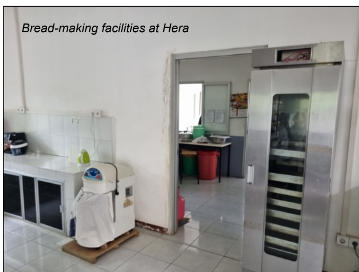
Bread-making facilities at Hera

The school has a bread kitchen which was supported by ATLAS through the provision of a large oven. The community benefits from access to wholesome fresh bread daily. This project also provides a livelihood for the women who make the bread. They are well on the way to creating a sustainable small business.